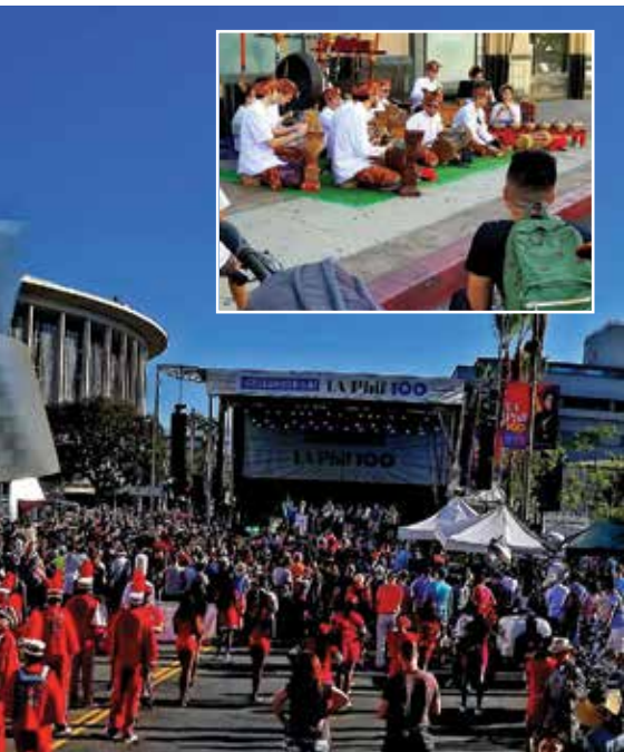
On September 30, the LA Phil celebrated its 100th birthday by hosting a free festival, complete with food trucks, gamelan orchestras (inset), and more, on the eight-mile route between its two homes: Walt Disney Concert Hall and the Hollywood Bowl.

to Frank Zappa: a performance of his irreverently titled G-Spot Tornado , as well as The Doors' LA Woman . Composer John Adams, who has maintained longstanding ties with the orchestra, was represented by Wild Nights , the third Emily Dickinson poem from Harmonium , and Sri Moonshine , the rhapsodic second movement of The Dharma at Big Sur . And the concert all ended with a rambunctious rendition of the Beach Boys' "Good Vibrations," followed by an outdoor psychedelic light show that lit up the silver skin of the hall.