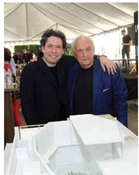
Music Director Gustavo Dudamel and architect Frank Gehry at the 2018 launch of the new 25,000-square-foot, Gehry-designed headquaters for Youth Orchestra Los Angeles, which will open in the city’s Inglewood neighborhood in 2020.