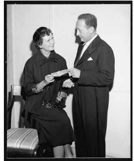
In 1964, the LA Phil moved to the Dorothy Chandler Pavilion in the brand-new Music Center, its home until 2003. Above, namesake Dorothy Chandler backstage at the Dorothy Chandler Pavilion with Jascha Heifetz.

The move to the Dorothy Chandler Pavilion coincided with a remarkable period of growth for the orchestra, spearheaded