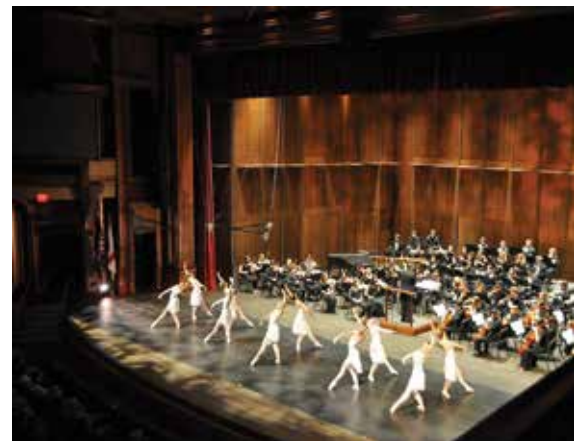
The Tallahassee Youth Orchestras at the 2017 world premiere of Celestial Dance by Pulitzer Prize-winning composer Ellen Taaffe Zwilich, written for the orchestra and Tallahassee Ballet.