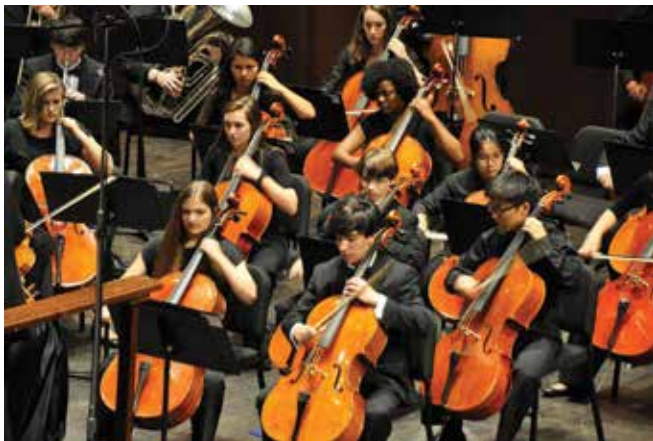
Members of the Tallahassee Youth Orchestras in performance. The orchestra commissioned Pulitzer Prize-winning composer Ellen Taaffe Zwilich to write Celestial Dance for the orchestra and Tallahassee Ballet in 2017.