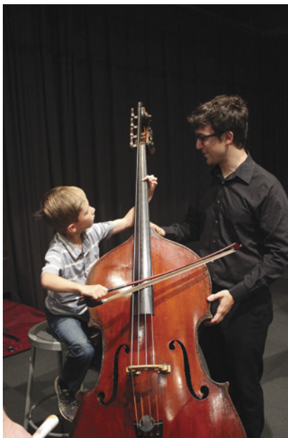
Instrument petting zoos are a frequent component of orchestras' young people's concerts. Above and right, musicians from the Annapolis Symphony Orchestra introduce youngsters to the double-bass, oboe, and trumpet at a recent education concert.