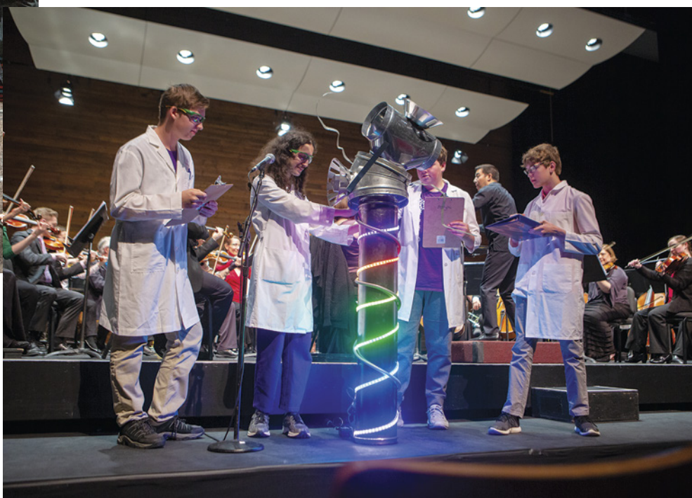
A 2019 Eugene Symphony Beethoven-themed family concert included a Musical Time Machine devised by the South Eugene Robotics Team, a program for high school students.