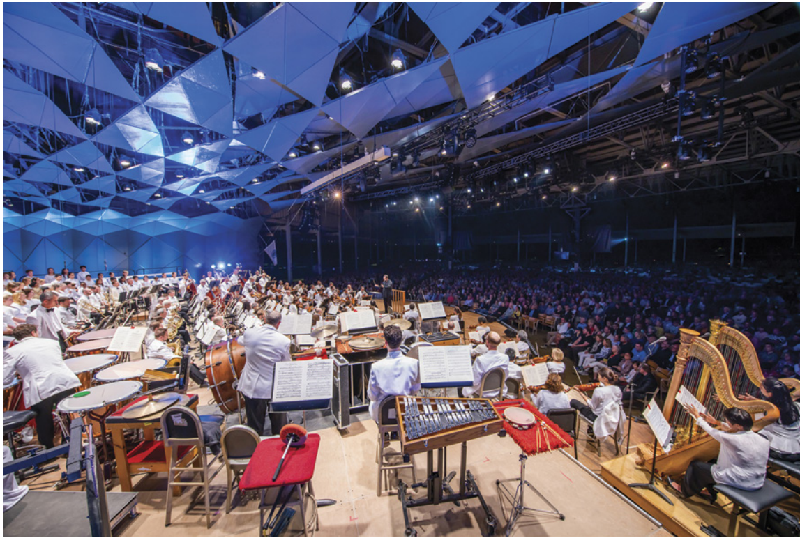
Music Director Andris Nelsons leads the Boston Symphony Orchestra at Tanglewood, which features contemporary scores within a broad musical lineup.