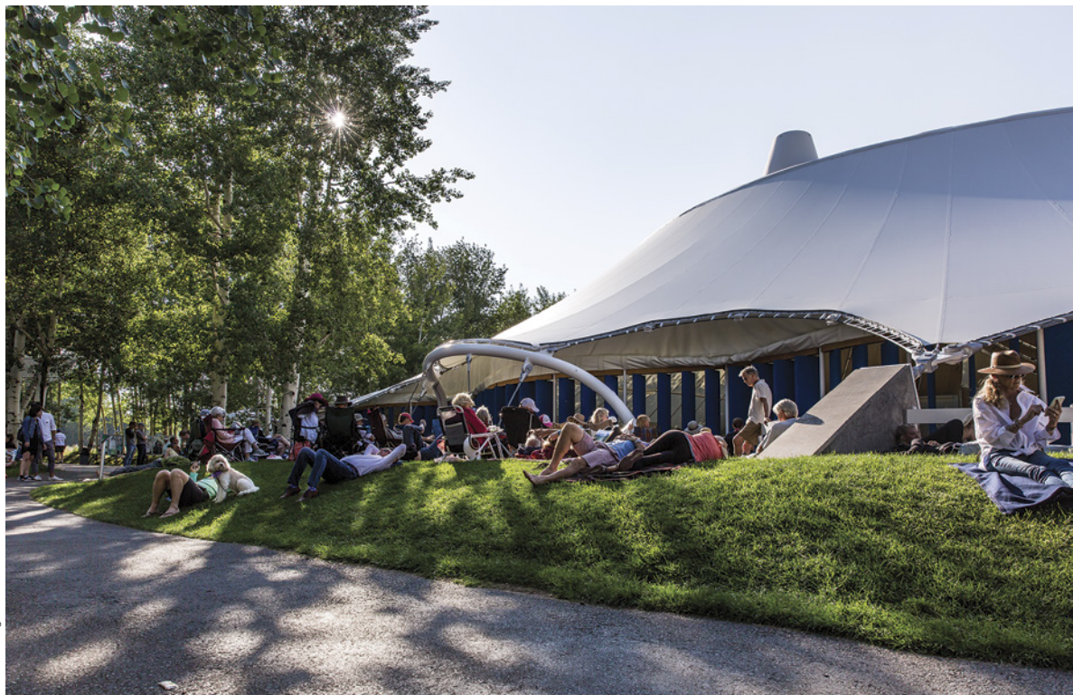
The bucolic scene at Colorado's Aspen Music Festival and School, where audiences and students experience programming that ranges from the classical to the contemporary.