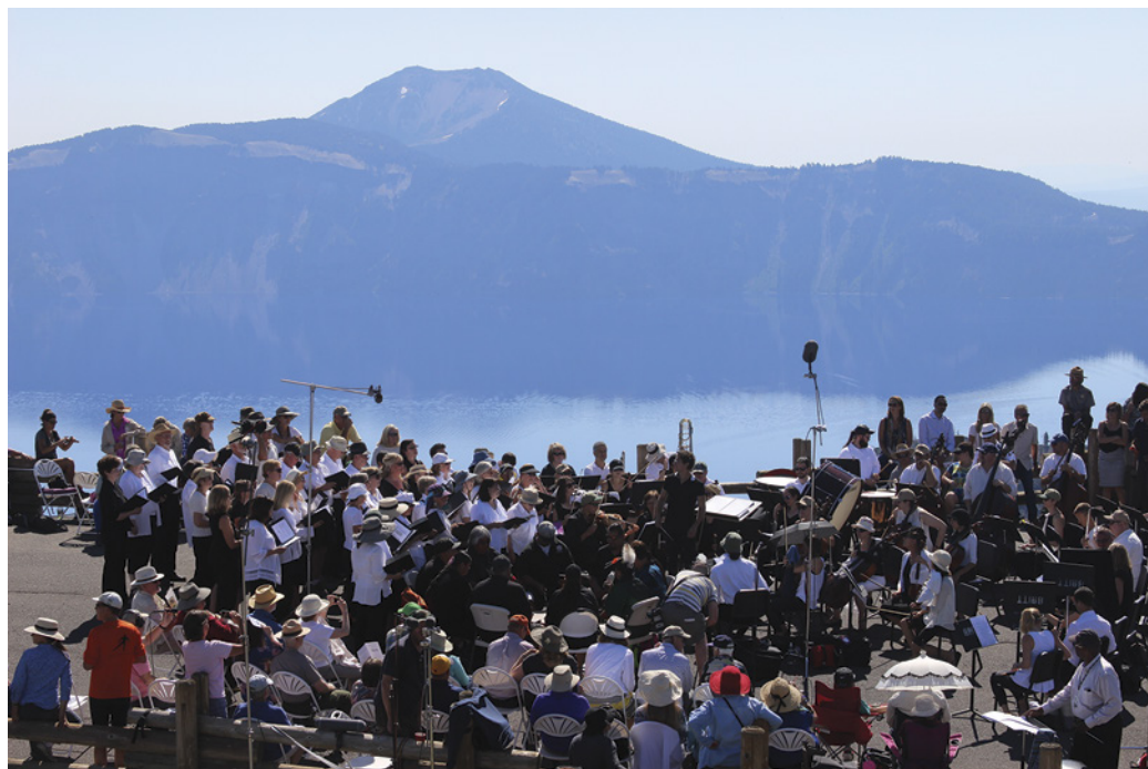
In 2016, the Britt Festival Orchestra, led by Music Director Teddy Abrams, gave the world premiere of Michael Gordon’s Natural History at Crater Lake National Park.

A work from any period depends on performers to get its message across, and some festivals give musicians free rein to do whatever they can to connect their audiences with the pieces. The Britt Festival strives to create “an environment where we share,” Abrams says. “We talk about the music we’re playing and why. We explain the theme of the program and what we were imagining in creating it. We talk about who the living composers are and who the non-living composers are. When the audiences understand that these composers are real people who are living and breathing music, they listen in a differ-