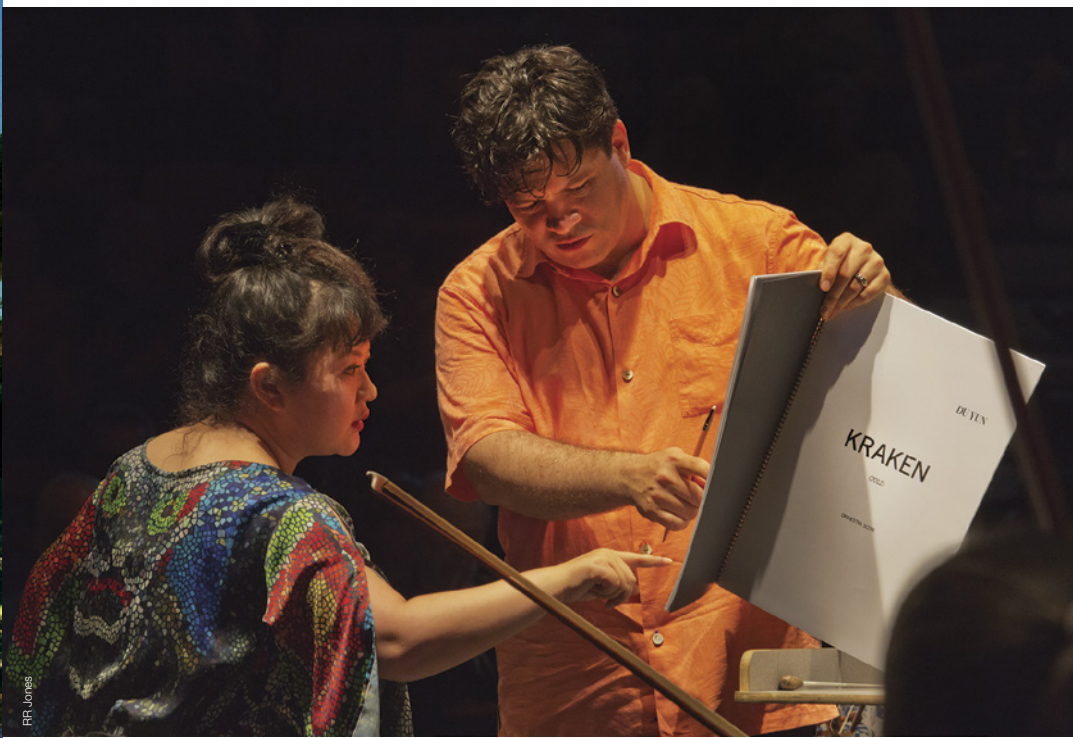
California's Cabrillo Festival of Contemporary Music focuses on the sounds of today. In photo: composer Du Yun consults with Music Director Cristian Măcelaru on one of her scores.