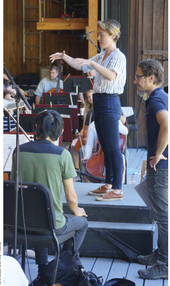
Britt Music and Arts Festival

their parameters if they’re guided,” he says. So he chose works that led listeners gradually into the world of new music. “For the first couple of years, I programmed shorter pieces—eight minutes in length. I made sure they were rehearsed and played better than anything else, and that they were