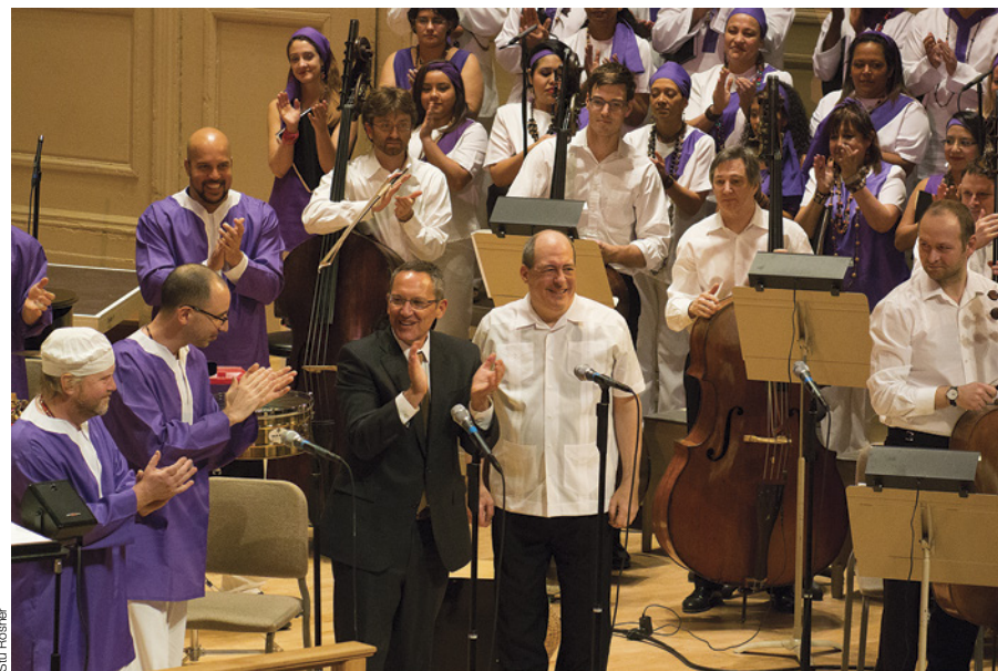
Composer Osvaldo Golijov has a long association the Boston Symphony Orchestra's Tanglewood festival, first as a student, then a teacher, and now as often-programmed composer. In photo: Golijov bows with conductor Robert Spano at the Boston Symphony Orchestra's 2014 performance of his La Pasión según San Marcos .

The Britt Music and Arts Festival in southern Oregon will celebrate Beethoven's 250th birthday its own way. Yes, Music Director Teddy Abrams will lead a performance of the Ninth Symphony. But that's only the beginning. Abrams and the festival will leverage the composer's quarter-millennium to promote the music of today. "We thought about all the Beethoven celebrations going on, and there are so many where all you're doing is playing more Beethoven," Abrams says. At this year's Britt Festival, "the biggest celebration is to have artists coming in