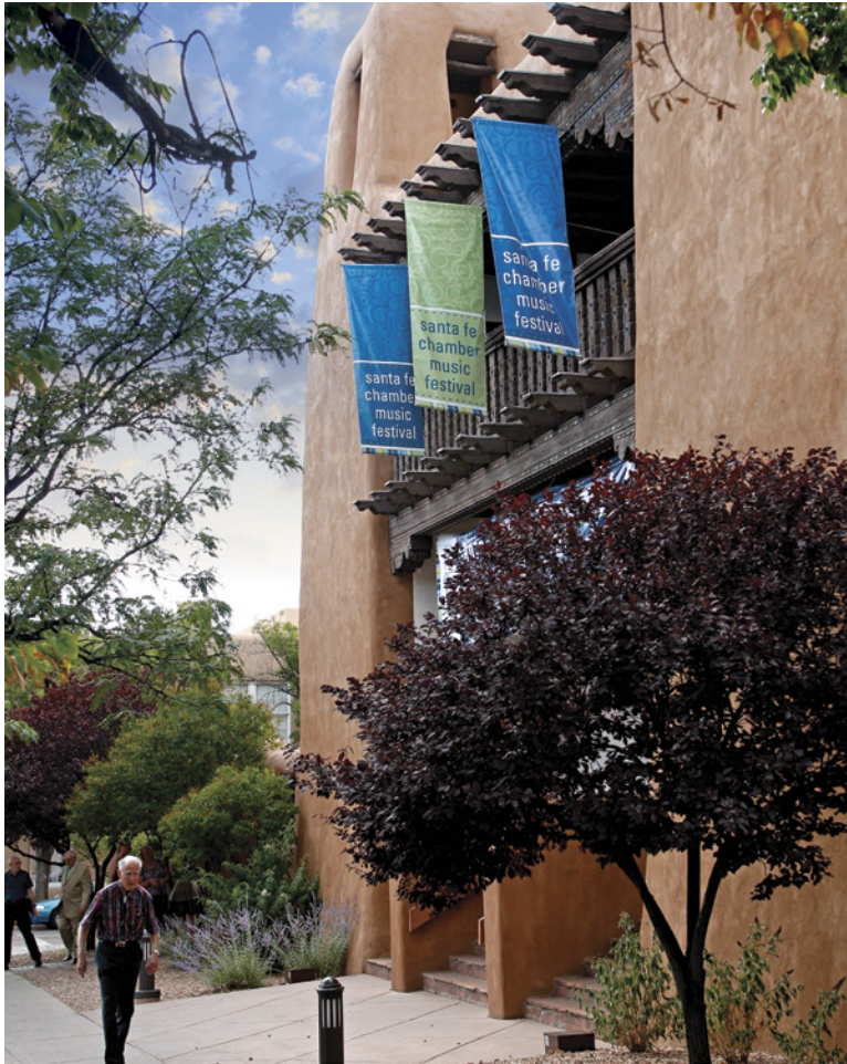
Santa Chamber Music Festival

In New Mexico, the Santa Fe Chamber Music Festival balances newer and older works.