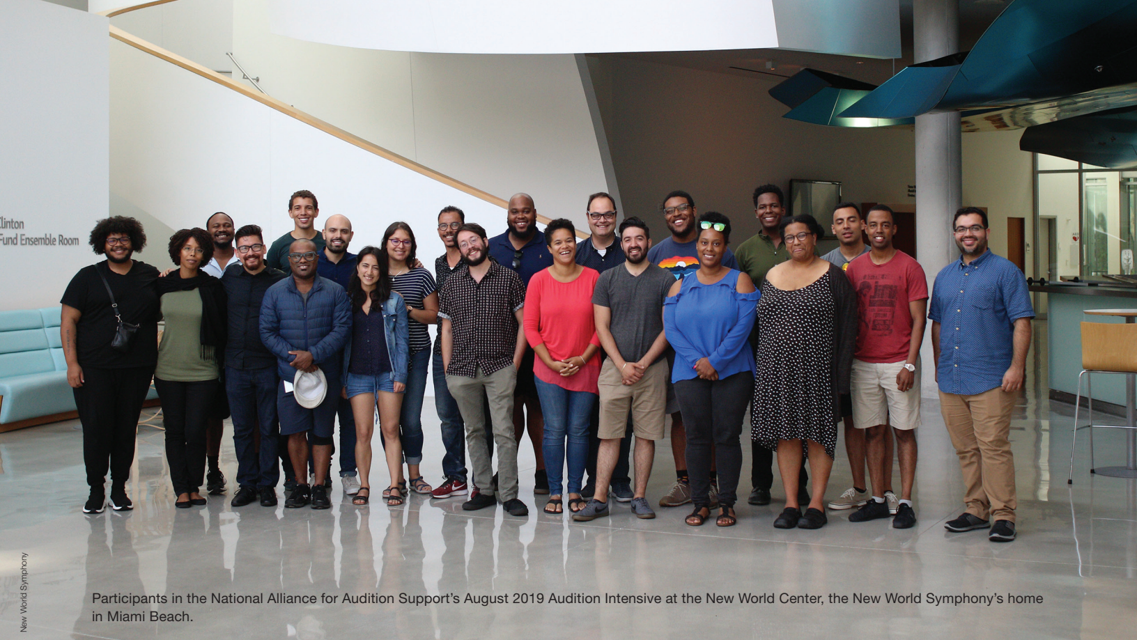
Participants in the National Alliance for Audition Support's August 2019 Audition Intensive at the New World Center, the New World Symphony's home in Miami Beach.