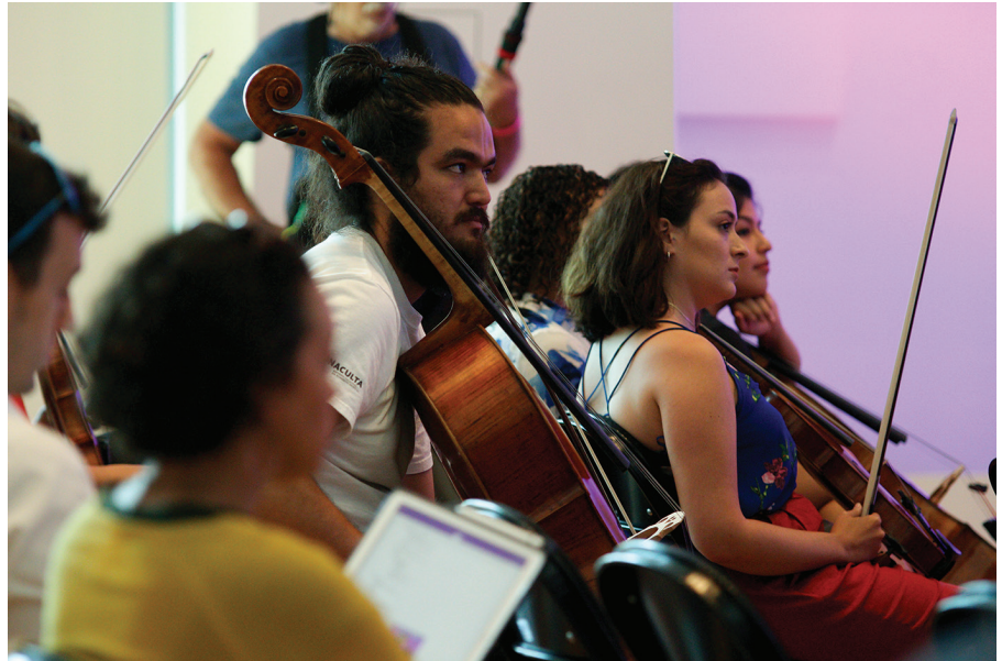
Above and below: A session during a NAAS Audition Intensive at New World Symphony.

Visit auditionalliance.org for more information.