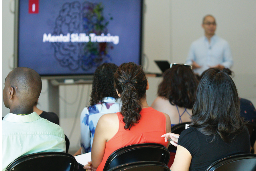
New World Symphony