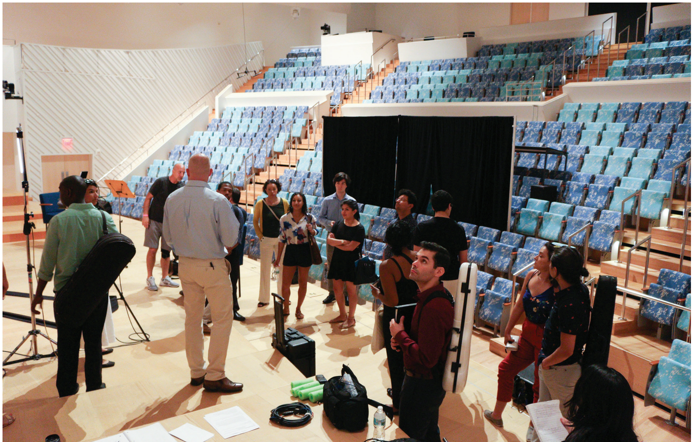
NAAS musicians familiarize themselves with concert hall set-ups and mock auditions during NAAS Audition Intensives at New World Center, home of Florida’s New World Symphony.