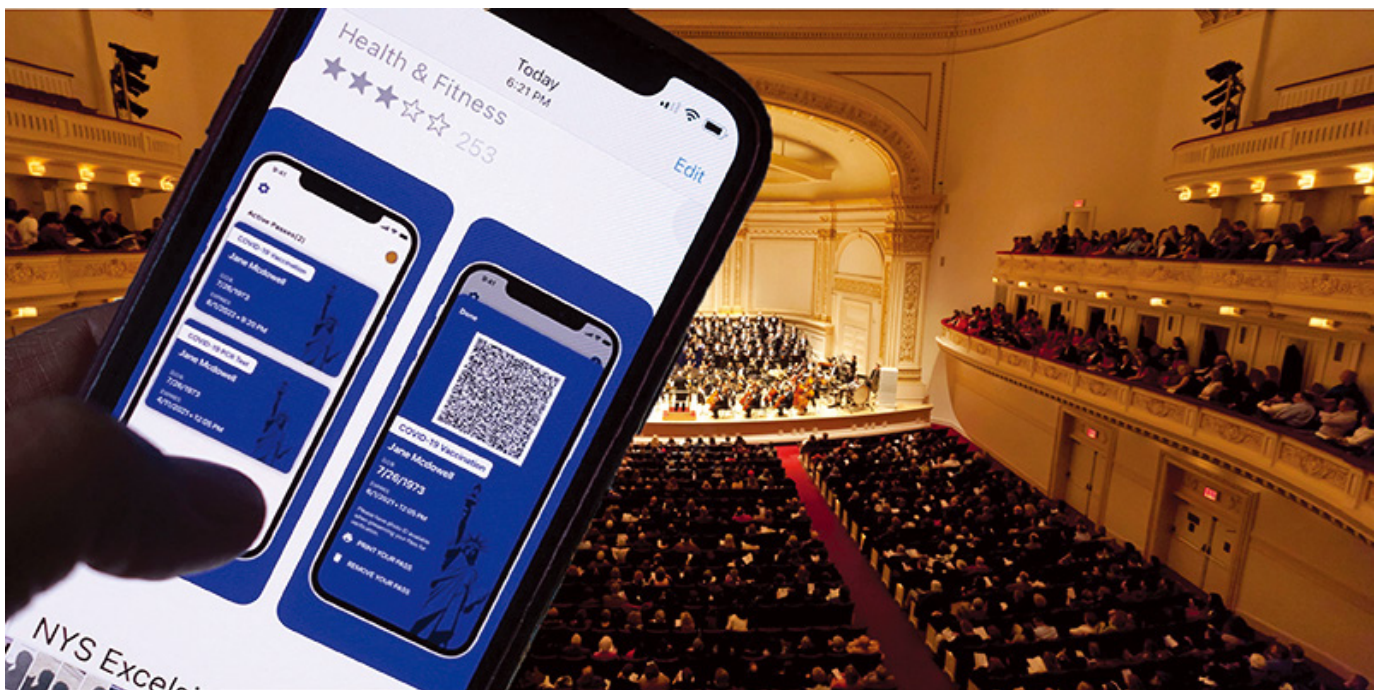
Carnegie Hall  Inset: Excelsior Pass, an app for New York residents that displays proof of COVID-19 vaccination.

Not that long ago, debates about audience dress at concerts revolved around tuxedos versus t-shirts. Going into the fall of 2021, the stakes are a bit higher. Should patrons wear masks? Should they come with proof of vaccination? Can they even sit next to each other in an enclosed space? As orchestras around the country gear up for their new seasons, they face not only an ongoing pandemic but also a seemingly intractable culture war that has made basic public safety measures into political third rails. In such a landscape, what are orchestras doing to keep people safe? How are they staying on top of the ever-changing COVID-19 crisis? To