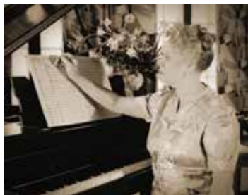
Composer Florence Price, at the piano in 1941.