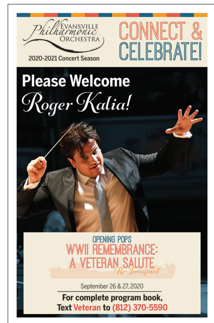
Poster for a September 2020 concert by the Evansville Philharmonic featuring big-band music, patriotic tunes, and other music from the World War II era.

The orchestra played to an audience capacity of 250 for several months after the season opener, but this, too, was further reduced as COVID cases rose this fall around the nation. Kalia did manage performances of Milhaud’s ballet suite La Création du monde in November, with strings arrayed behind him and winds in front. As COVID restrictions tightened, Kalia