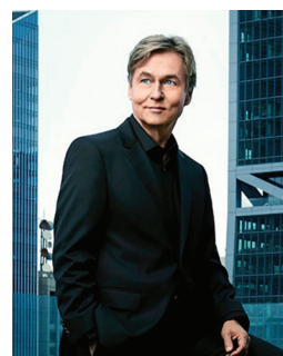
Esa-Pekka Salonen, the San Francisco Symphony's new music director.