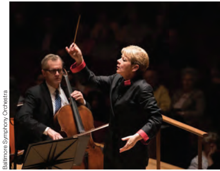
Baltimore Symphony Orchestra Conductor Marin Alsop, seen here with the Baltimore Symphony Orchestra, will lead orchestras on five continents in Beethoven's Ninth for "All Together: A Global Ode to Joy," a year-long project starting in December to mark the 250th anniversary of the composer's birth. Each partner organization will reimagine the piece for its own community.