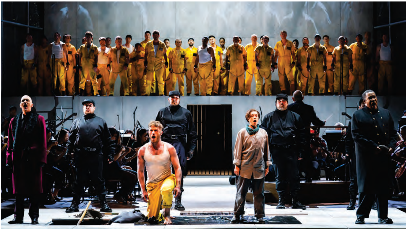
This June, the New York Philharmonic and Music Director Jaap van Zweden gave the world premiere of David Lang's opera prisoner of the state (in photo), a contemporary retelling of Beethoven's Fidelio, as part of the orchestra's three-week Music of Conscience series. Prisoner of the state was co-commissioned by the New York Philharmonic, Rotterdam's de Doelen, London's Barbican, Barcelona's l'Auditori, Germany's Bochum Symphony Orchestra, and Bruges's Concertgebouw.

So, given his everlasting influence and dominance and legacy, what will this chockablock Beethoven season across the country yield? In any given year, Beethoven and Mozart already vie for