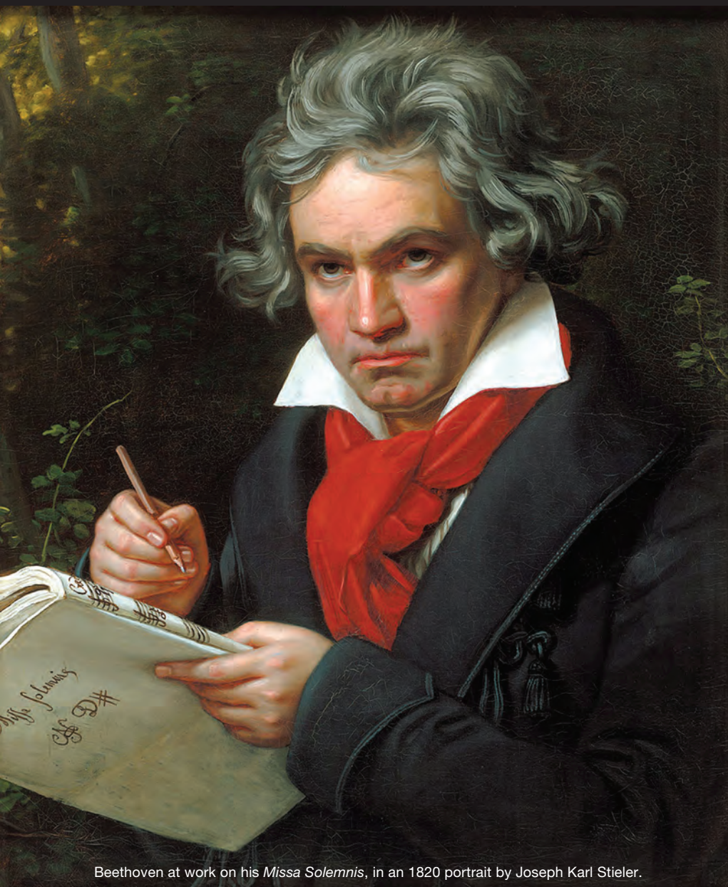
Beethoven at work on his Missa Solemnis , in an 1820 portrait by Joseph Karl Stieler.

Sing to me of the man, Muse, the man of modulations driven time and again off course of his theme, while he developed and plumbed the depths of the symphonic form... [with apologies to Homer]