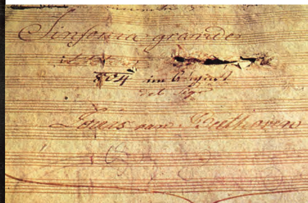
Visible on the title page of Beethoven's Symphony No. 3 ("Eroica"): the composer's erasure of the work's original dedication to Napoleon.

The epic myth of the scowling, hot-tempered, iconoclastic Ludwig van Beethoven, who this year would have turned 250, continues to loom over the classical arena and its programs. His epic is recited to patrons nightly in the concert hall, namely through his nine most celebrated tales: The Symphonies. Beethoven made strides in every form he put his hand to—notably the pia-